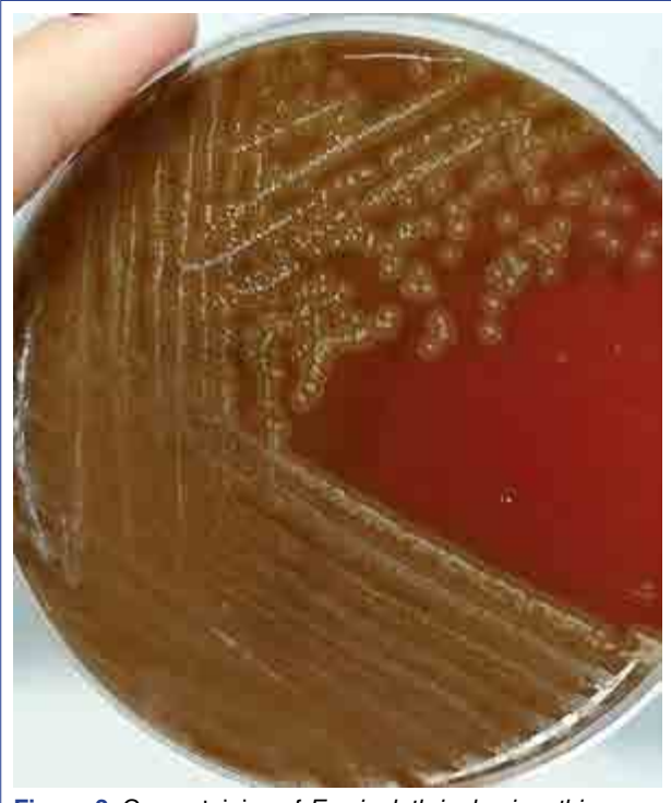
Figure 3. Gram staining of Erysipelothrix rhusiopathiae.

ated. On the fourth day, the patient's dialysis catheter became obstructed and dialysis was terminated earlier than expected. The patient experienced a bradycardic cardiopulmonary arrest, though the potassium level was normal. He was intubated, and after 10 minutes of cardiopulmonary resuscitation, his hemodynamic status was stabilized. The control echocardiography revealed mild pericardial effusion, normal left ventricular function, depressed right ventricular function with right ventricular and atrial dilatation, a pulmonary artery systolic pressure of 55-60 mmHg and suspected vegetation on the tricuspid leaflet. Transesophageal echocardiography (TEE) revealed filamentous vegetation on the atrial side of the tricuspid valve and a thrombus-like image attached to the tip of the dialysis catheter (Fig. 4). The dialysis catheter obstruction of the previous day and the thrombus seen in the catheter lumen suggested that the etiology of the cardiopulmonary arrest might have been a pulmonary embolism originating from the catheter. It was not possible to perform a pulmonary contrast angiography since the patient was in acute kidney failure. Thrombolysis for a possible acute pulmonary embolism was also not performed because though the patient was hemodynamically stable, severe anemia and thrombocytopenia were present. Dobutamine therapy was implemented to increase the contractility of the right ventricle.