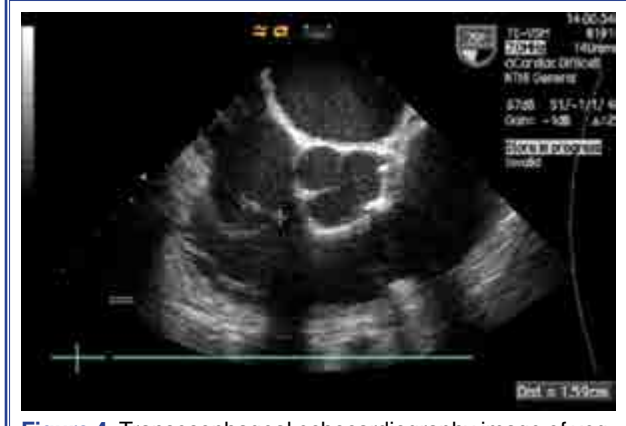
Figure 4. Transesophageal echocardiography image of vegetation on the tricuspid valve.

Despite ceftriaxone therapy, the patient had a persistent fever of 38°C. Therefore, his antibiotic therapy was changed to meropenem and vancomycin empirically. Multidrug resistant Acinetobacter bauman nii ( A. baumannii ) was detected in blood cultures of pleural and pericardial fluid, and colistin was added