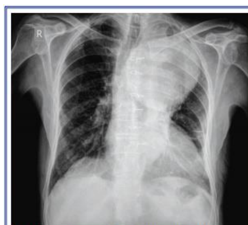
Figure 1. Anteroposterior chest radiogram: a mass lesion with smooth contours, and largest diameter approaching 120 mm which filled up left upper zone completely

ventricular hypertrophy, a mild degree of global left ventricular hypokinesia, enlargement of ascending aorta with its largest diameter of 42 cm, moderate mitral, and aortic regurgitation, mild-moderate tricuspid regurgitation, moderate pulmonary hypertension were detected, and ejection fraction was measured as 45 percent. Suprasternal area could not be evaluated clearly because of superimposed echogenicity. Contrast-enhanced thorax CT detected an aortic aneurysm involving only aortic arch with a diameter approaching to 120 mm at the level of aortic arch. (Figure 2). Patent true lumen was nearly 80 mm in diameter. However on the lateral aspect, non-calcified heterogeneous atheromatous plaques, and on the periphery alterations consistent with a hematoma were seen (Figure 2). Aneurysm filled all apicoposterior region of the left upper lobe. However, any pathology was not detected in lungs, and mediastinum. Referral of the patient to another center was planned for surgical evaluation, but the patient rejected, and thus included in the medical follow-up protocol. At 4. th month of the follow-up period he died.