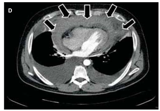
Figures. ( A , B ) Transthoracic echocardiography image showing a 4.3 cm mass surrounding the apex of the heart and obstructing ultrasound waves ( C ) Tissue Doppler echocardiography showing a more than 25% respiratory variation of mitral inflow ( D ) Computed tomography showing a solid mass lesion with irregular margins and heterogeneous structure, consisting of patchy cystic and fat density areas and surrounding the heart and pericardium with margins obscured by the pericardium and measuring 16x7 cm at the widest area. Bilateral pleural effusion is also observed.

structure, consisting of patchy cystic and fat density areas. The mass was observed to originate from the prevascular region in the anterior mediastinum, extending to the craniocaudal region for approximately 17.5 cm of the segment and surrounding the heart and pericardium, with margins obscured by the pericardium and measuring 16x7 cm at the widest area (Figure D). A sternotomy with midsternal incision was performed at the thoracic surgery clinic where the cyst was excised and sent for pathological evaluation. The patient was later referred to the oncology clinic following diagnosis of lymphoma from the pathologic investigation.