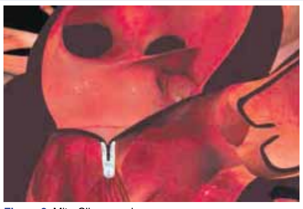
Figure 2. MitraClip procedure.

The MitraClip system consists of a catheter to guide