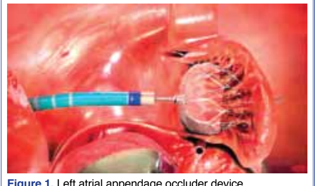
Figure 1. Left atrial appendage occluder device.

Percutaneous methods have been developed since