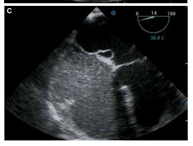
Figures. (A) Transesophageal echocardiography showing a saccular, cystic lesion with a broad base and thin membrane, hanging on the fossa ovalis. Note the homogeneity of the echolucency within the cavity (Video files 1a, 1b). (B) Color Doppler image showing no flow in the cavity of the interatrial septal aneurysm (Video file 2). (C) No contrast filling in the cystic lesion after agitated saline injection (Video file 3). *Supplementary video files can be found in the online version.