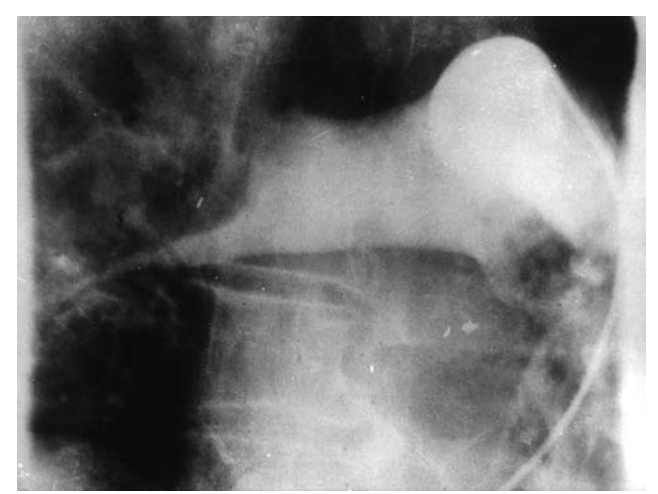
Figure 2. Pulmonary artery angiography showing near occlusion of the proximal right pulmonary artery.

acute PE. Pulmonary artery angiography demonstrated nearly total occlusion of the proximal right pulmonary artery (Fig. 2). Coronary angiography showed normal coronary arteries. After the diagnosis was made and at the second hour of admission to the coronary care unit, 48-hour streptokinase infusion was initiated with a rate of 100,000 U/hr following a bolus injection of 250,000 U in 30 min. At the sixth hour of streptokinase infusion, complete AV block resolved and the ECG showed incomplete RBBB, and inverted T waves in leads V1-4. During the first 24 hours, intermittent short AV block episodes were seen. Standard heparin infusion was started for seven days after the completion of streptokinase therapy. Clinical and laboratory findings improved during therapy. On the forth day,