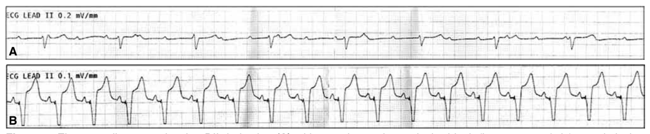
Figure 1. Electrocardiograms showing DII derivation (A) with complete atrioventricular block (heart rate 43/min) on admission and (B) following implantation of a transvenous permanent ventricular cardiac pacemaker (heart rate 93/min).