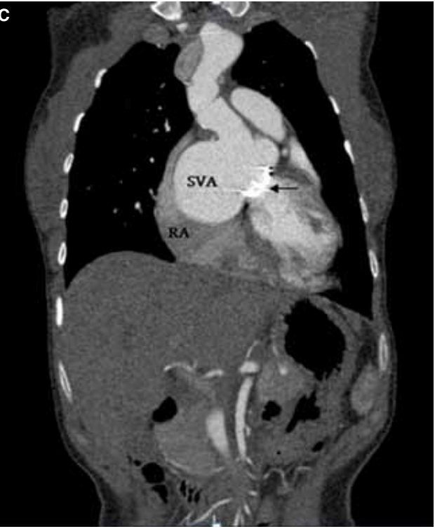
Figures. (A) Transthoracic echocardiogram in the apical four-chamber view showing a noncoronary sinus of Valsalva aneurysm (SVA) protruding to both left (LA) and right (RA) atria. (B, C) Sixty-four-slice cardiac computed tomography images. (B) Axial image showing noncoronary SVA compressing all pulmonary veins (PV) and the LA. The dissection flap in the descending thoracic aorta is also seen between the false (FL) and true (TL) lumens. (C) Coronal image showing noncoronary SVA compressing the RA. Arrow indicates the mechanical aortic valve. LV: Left ventricle; RV: Right ventricle.