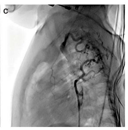
Figures— (A) Aortography shows that first arc vessels are the left and the right common carotis and secondly the right subclavian artery. Also, a rising collateral vessel goes to the left shoulder (arrow). Selective hand angiography of the collateral arteries shows a tortuous and posterior course in (B) an anterio-posterior view, and (C) a lateral view. Selective hand angiography shows (D) vertical patent ductus arteriosus, and (E) the ductus occluded with the Amplatzer vascular plug conserving dog's bone configuration and no occlusion at the left pulmonary artery before deployment of the device.