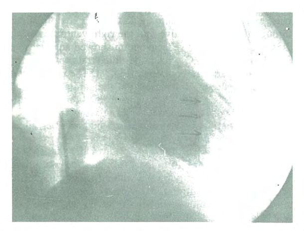
Figure 2: Left ventriculography showing a filling defect in the anterolateral, apical, and inferoapical walls (arrows).

and absence of solitary atrial rhabdomyomas in former series, we assume our patient also had multiple rhabdomyomas involving both the atrium and the ventricle, although the left ventricular mass could not be examined pathologically. Low cardiac output and congestive heart failure may contribute as evidence to ventricular involvement.