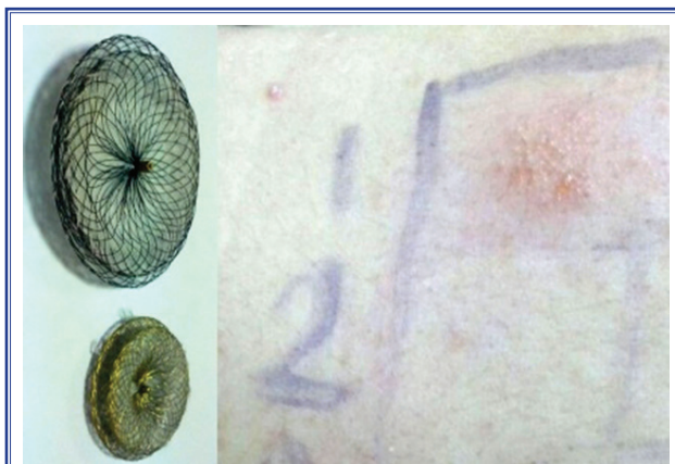
Figure 2. The patch test result of 2 different atrial septal occluder devices.