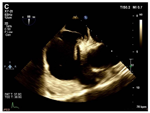
Figures— (A) Bilateral pulmonary thromboemboli in a pulmonary computed tomography (CT) angiography image; (B) Large tubular thrombus (arrow) observed passing through a patent foramen ovale on a CT scan; (C) Large tubular thrombus (arrow) crossing the patent foramen ovale seen in the modified bicaval view of transesophageal echocardiography. IAS: Interatrial septum; LA: Left atrium; RA: Right atrium. *Supplementary video files associated with this presentation can be found in the online version of the journal.