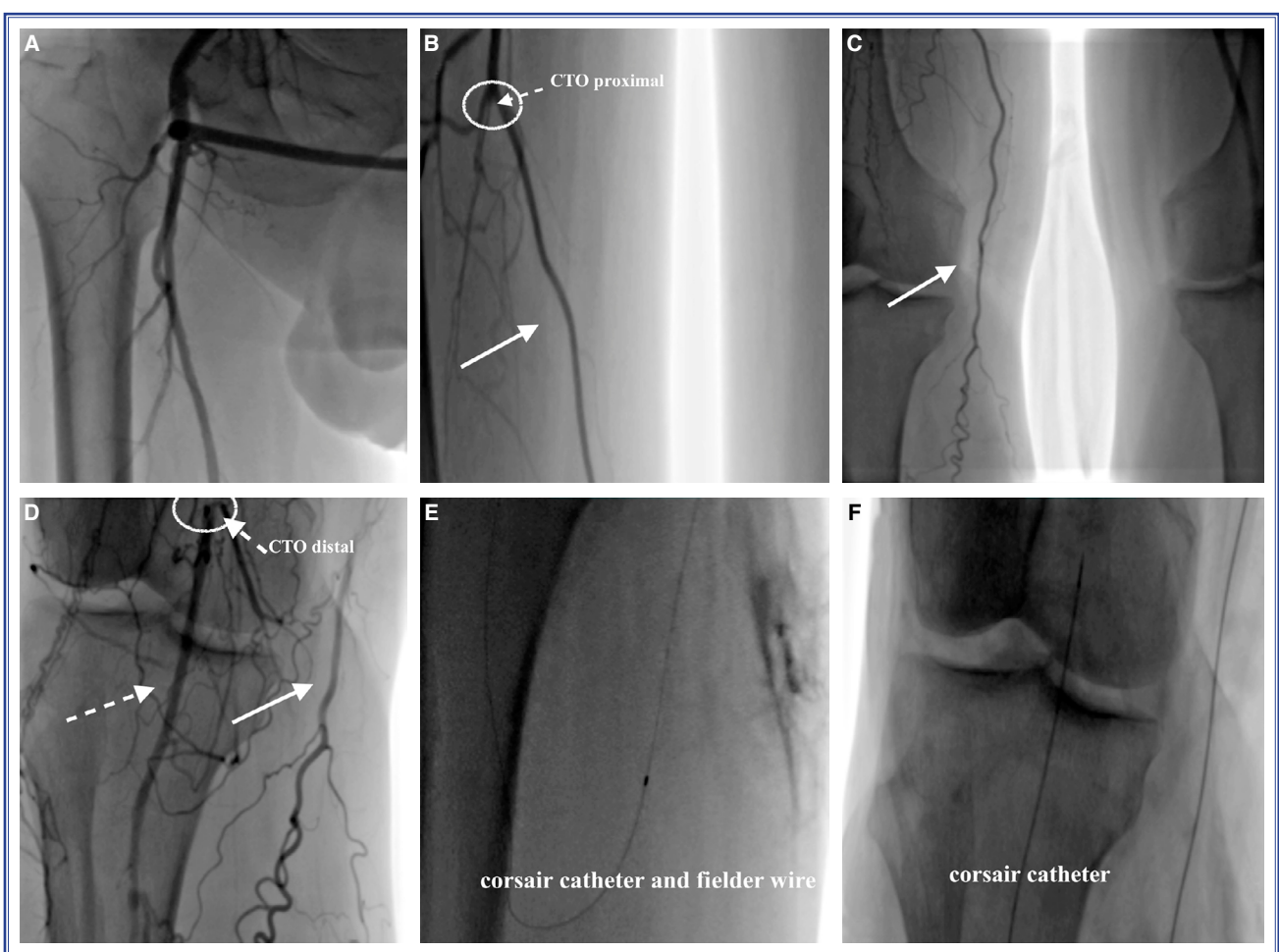
Figure 1. (A) Superficial femoral artery occlusion; (B) Collateral flow (arrow) (C) Collateral flow (arrow); (D) Filling of popliteal artery with collateral flow (dashed arrow); (E) Fielder wire and Corsair catheter (Asahi Intecc USA, Inc., Tustin, CA) in the popliteal artery via collateral approach; (F) Corsair catheter in the popliteal artery.

Femoropopliteal lesions are the most common peripheral arterial interventions, accounting for approx-