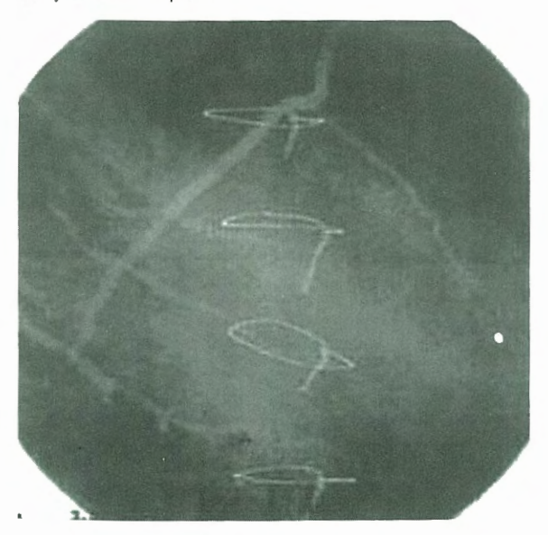
Figure 3. Diagonal - Obtuse marginal 1 - Obtuse marginal 2 - Posterolateral circumflex artery sequential left ITA anastomoses in 10^{\rm th} day after the operation

grafting in the second postoperative year. Seven patients underwent percutaneous transluminal coronary angioplasty because of progression of native vessel stenosis or occlusion of saphenous vein grafts. The other patients with angina or angiographic problems were receiving medical therapy at the completion of this study.