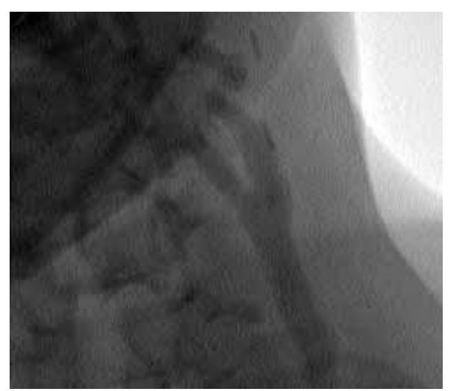
Figure 3. Carotid angiography showing normal blood flow and smoothly reconstructed carotid artery.

The difference in the use of the patch in our case was that it was placed double layer, inside-out, and