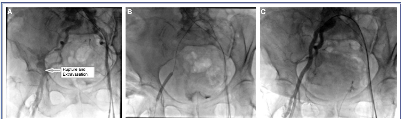
Figure 1. Peripheral angiography images. (A) Rupture of the iliac artery and contrast media extravasation. (B) Balloon inflation to stop hemorrhage. (C) Stent implantation and final angiography showing no rupture.

Case 2 – An 84 year-old-man with severe AS underwent transfermoral aortic valve implantation under local anesthesia. Aortic annulus sizing on trans-