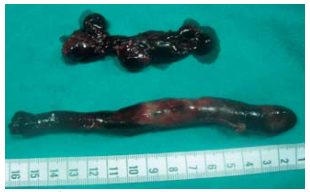
Figure 2. Gross appearance of the giant thrombus, approximately 150 mm in length, and the smaller fresh thrombus.

operating room. However, cardiac arrest developed during induction of anesthesia. Despite open heart massage following quick median sternotomy and pericardiotomy, all resuscitation efforts were unsuccessful. Thrombotic material, which was 150 mm in length, was removed from the right atrium (Fig. 2). There was also fresh thrombus formation around the thrombotic mass. Pathological examination showed the mass to be a thrombus.