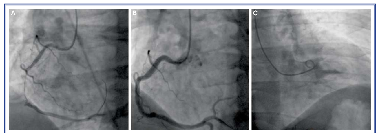
Figure 2. (A, B) Guide wire in the RCA before and after relieving the spasm. (C) Hypertrophic myocardial wall on left ventriculography.

He has remained symptom-free for 1 year.