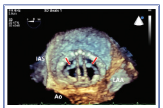
Figure 2. Real-time 3-dimensional transesophageal echocardiography demonstrates pannus formation (see arrows) on the ventricular side of the mitral prosthesis in the 2nd patient. Ao: Eortic; IAS: Interatrial septum; LAA: Left atrial appendage.

The third case was a 50-year-old woman who underwent aortic valve replacement (AVR) (St. Jude Medical, 19 mm) and MVR (St. Jude Medical, 27 mm) 13 years ago due to rheumatic heart disease. She