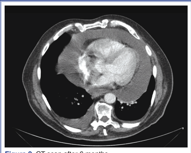
Figure 2. CT scan after 6 months.

The patient was also tested for other bacterial (including acid fast bacteria), fungal, and viral respiratory agents in the blood cultures, urine, serum and bronchoalveolar lavage (organisms tested= Legionella , Streptococcus pneumoniae , Mycoplasma pneumoni ae , rhinovirus, adenovirus, enterovirus, parainfluenza virus and respiratory syncytial virus) and all the results were negative. Multiplex RT-PCR with microarray technology was used to detect respiratory viruses (CLART<sup>®</sup> Pneumovir, Genómica S.A.U, Coslada, Madrid, Spain, which detects adenovirus, bocavirus, coronavirus type 229, enterovirus (echovirus), influenza virus A H1N1/2009, influenza viruses A, B and C, metapneumovirus A and B, parainfluenza viruses