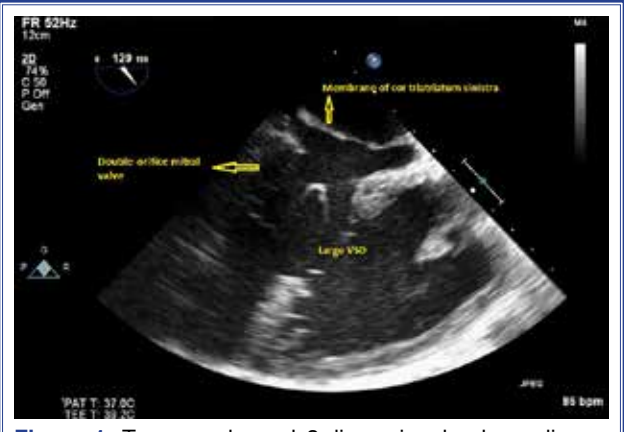
Figure 1. Transesophageal 2-dimensional echocardiography revealed cor triatriatum sinistrum, double-orifice mitral valve, large ventricular septal defect, and double outlet right ventricle. VSD: Ventricular septal defect.

Maternal transthoracic and transesophageal 2-dimensional echocardiography and color Doppler im-