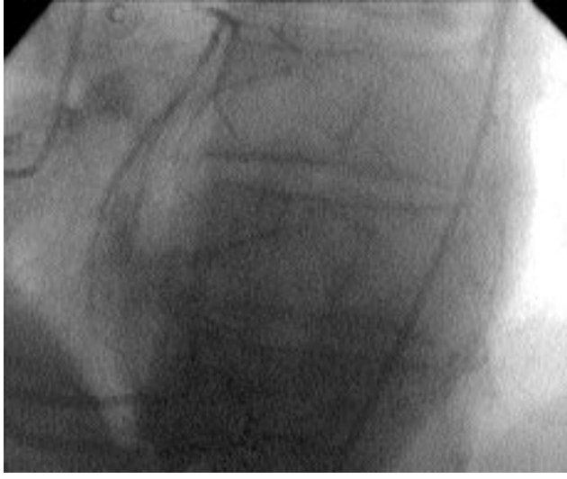
Fig. 2. Collateral vessels supplying the left coronary system from the right coronary artery.