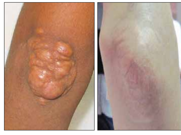
Figure 1A: Pre-apheresis xanthomas on the right elbow of the first patient.

A 13-year-old boy admitted to our clinic because his mother was concerned about brown skin lesions on his elbows, knees, and Achilles tendons (Figure 1a). The primary xanthomas first appeared on his knees and elbows when he was 5 years old. His parents were not consanguineous. His father was diagnosed with FH and died of MI due to CHD at 25 years of age. His mother's blood lipid