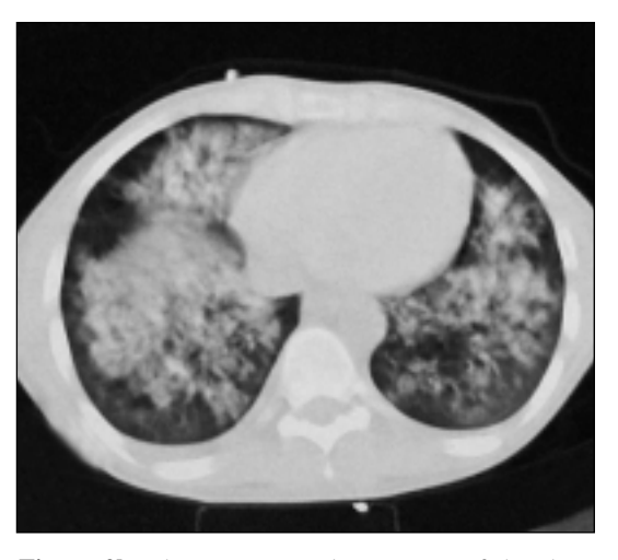
Figure 2b. Thorax computed tomogram of the chest showing diffuse alveolar hemorrhage.

lavage fluid analysis showed the presence of many red blood cells. The diagnosis of diffuse alveolar hemorrhage was made by the cli-