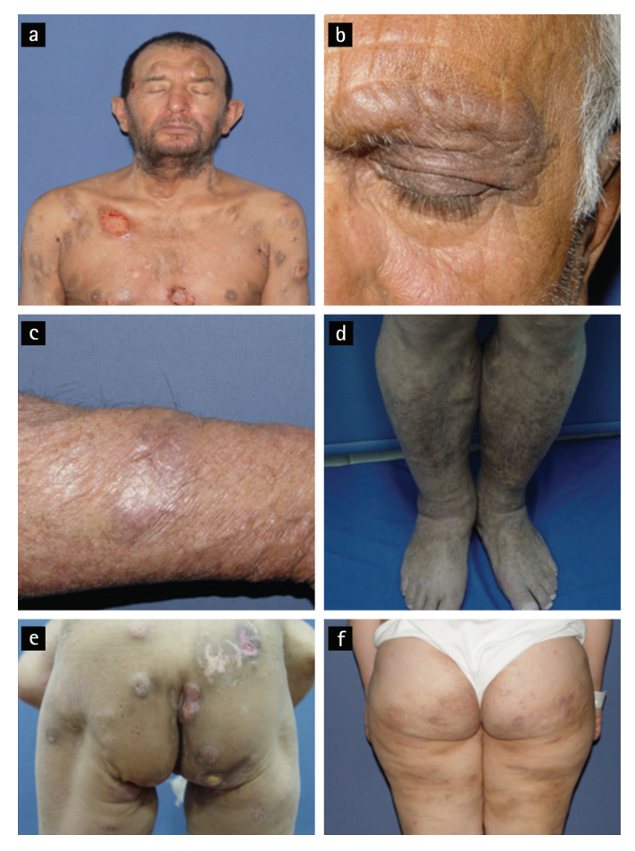
Figure 1. Histopathologically confirmed transformed mycosis fungoides (T-MF) lesions in different patients: extensive tumoral lesions with anaplastic transformation on the trunk (a); resistant tumoral lesion with loss of hair on eyebrow (b); refractory plaque on forearm (c); erythrodermic patient with ichthyotic lesions on legs, consistent with T-MF (d); postinflammatory hypopigmentary areas from previous treated tumors and tumoral lesions with anaplastic transformation (e); plaques and tumoral lesions on gluteal region and legs of a patient receiving extracorporeal photopheresis, interferon psoralen ultraviolet A, and bexarotene (f).

Laboratory findings are summarized in Table 3. High serum LDH levels were correlated significantly with poor survival (p=0.000). There was a statistically significant relationship