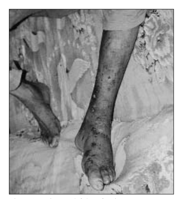
Figure 1. Lesions on left leg of patient.

Tekin SB, Erdem F, Gürsan N. Iatrogenic Kaposi's Sarcoma