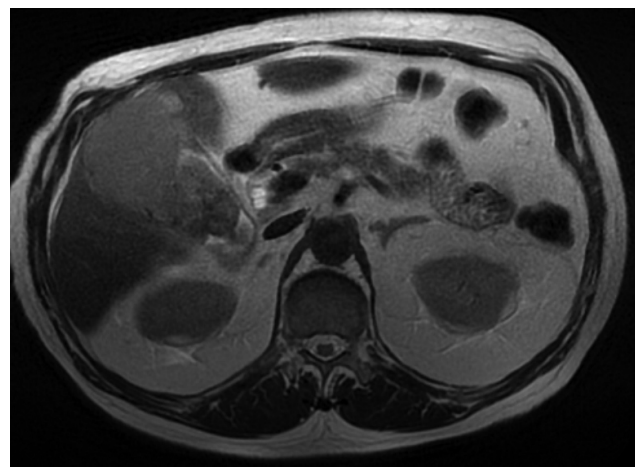
Figure 1. Preoperatively Abdominal magnetic resonance imaging (MRI) shows irregular wall thickening of the gallbladder and mass lesion size 112x63 mm completely filling the gallbladder and expands the liver.

A 70-year-old male presented with three months of abdominal pain in the upper right quadrant and weight loss. The patient reported medical history of chronic cholecystitis. Laboratory analysis revealed hemoglobin of 6 g/L, and a normal leukocyte count. Tumor markers including serum carcinoembryonic antigen, carbohydrate antigen 19-9 (CA 19-9) and \alpha -fetoprotein (AFP) levels , and liver function test results were within normal levels. Abdominal ultrasonography revealed a 3 cm gallbladder stone and irregular wall thickening of the gallbladder. Abdominal magnetic resonance imaging (MRI) showed irregular wall thickening of the gallbladder, mass lesion size 112x63 mm completely filling the gallbladder and extending into liver with parenchymal invasion (Figure 1). The preliminary diagnosis was gallbladder cancer. A radical cholecystectomy, with segment 4b and 5 resection of the underlying liver tissue and the pericholedochal lymph nodes were performed.