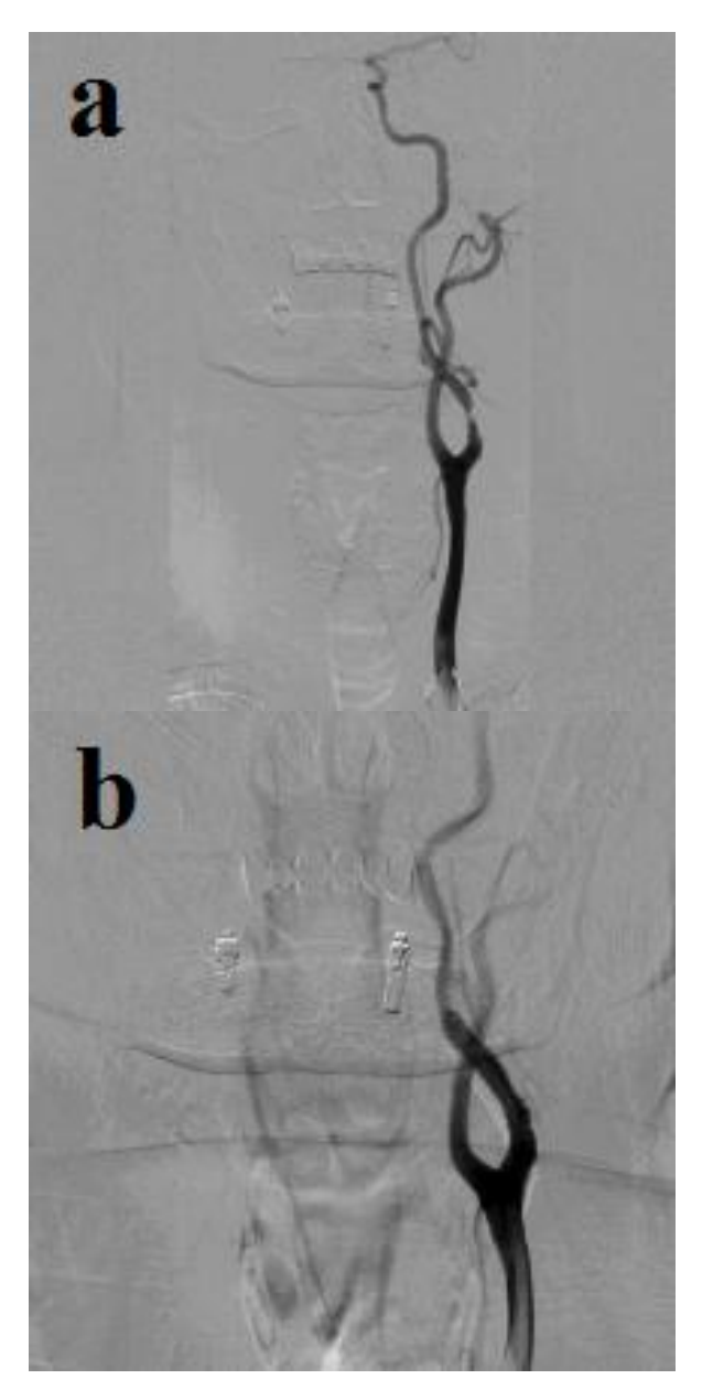
Figure I. Left carotid artery on digital subtraction angiography pre- (a) and post-stenting (b).

following CAS, including only the observation of vital signs and hydration. The severe aphasia and hemiparesis began to resolve after 24 h, and the patient's neurological findings returned to the admission baseline within 48 h. He was discharged from the hospital with mild motor aphasia and slight difficulty with complex commands. The patient gave informed consent and the local etthical commitee approved this report for publication.