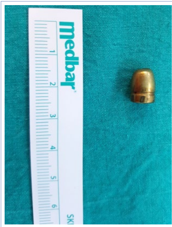
Figure 4. Bullet extracted from the superficial lobe of the right parotid gland.