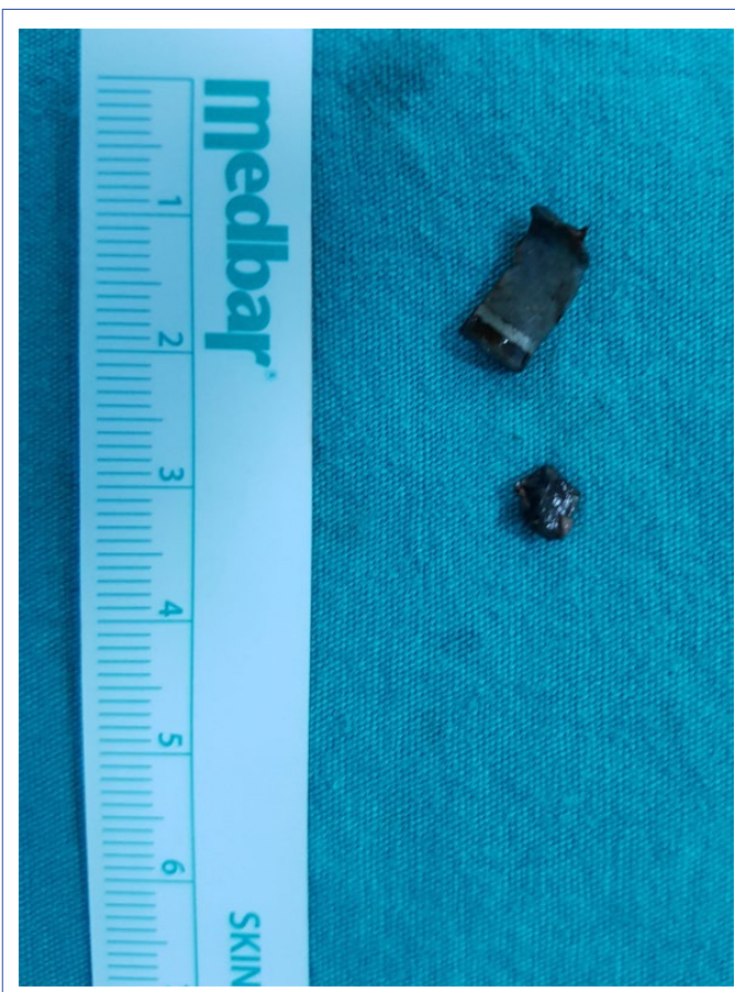
Figure 2. Bullet extracted from the superficial lobe of the left parotid.