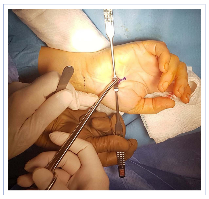
Figure 6. Checking the distal part of the transverse carpal ligament.

This approach was performed altogether 231 surgery in 217 patients (14 cases involved bilateral CTS) between the years 2008-2017. The mean age of the patients was 55.4\pm12.8 years (32 to 69), 175 (80.6%) were women and 42 (19.4%) were men. The assessment of CTS etiology showed that 189 (%87.1%) of the cases were idiopathic, 19 (8.8%) had