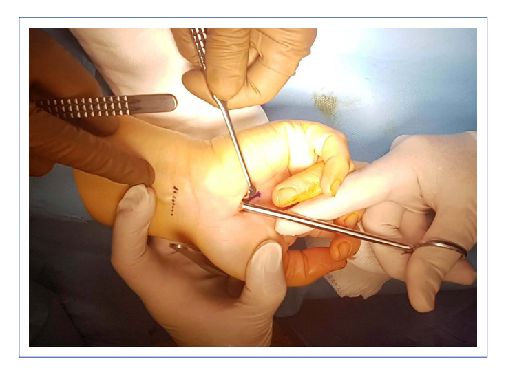
Figure 5. Checking the proximal end of the ligament.

stage, the surgeon confirms that there are no uncut areas on the TCL. Then, the median nerve distal from the incision is checked, if it is unconstrained and the remaining ligament portion is incised, in case there is any residual (Fig. 6). Following the hemostasis (usage of cautery must be avoided), the skin is closed subcutaneously with 3/0 vicryl. Two weeks after the surgery, the patients are taught the proper exercises.