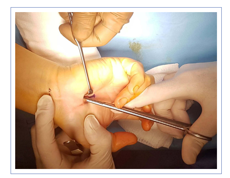
Figure 4. Cutting the transverse carpal ligament.