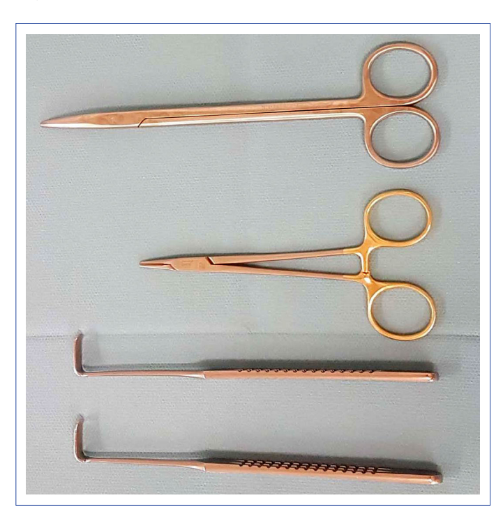
Figure 1. Surgical instruments.

The surgical instruments must be appropriate for a short incision (Fig. 1). A skin incision is made reaching 1 cm (the rate of surgical procedures with shorter incisions is 42.8%) distal from the starting point which is the intersection between the TCL and the longitudinal line drawn between the palmar side of the third and fourth fingers, towards the wrist (Fig. 2). The TCL is reached through the elimination of subcutaneous fatty tissue and palmar aponeurosis (while paying close attention to not severing superficial palmar