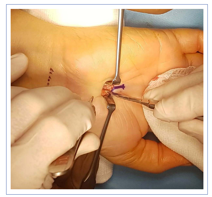
Figure 3. Reach to the transverse carpal ligament.