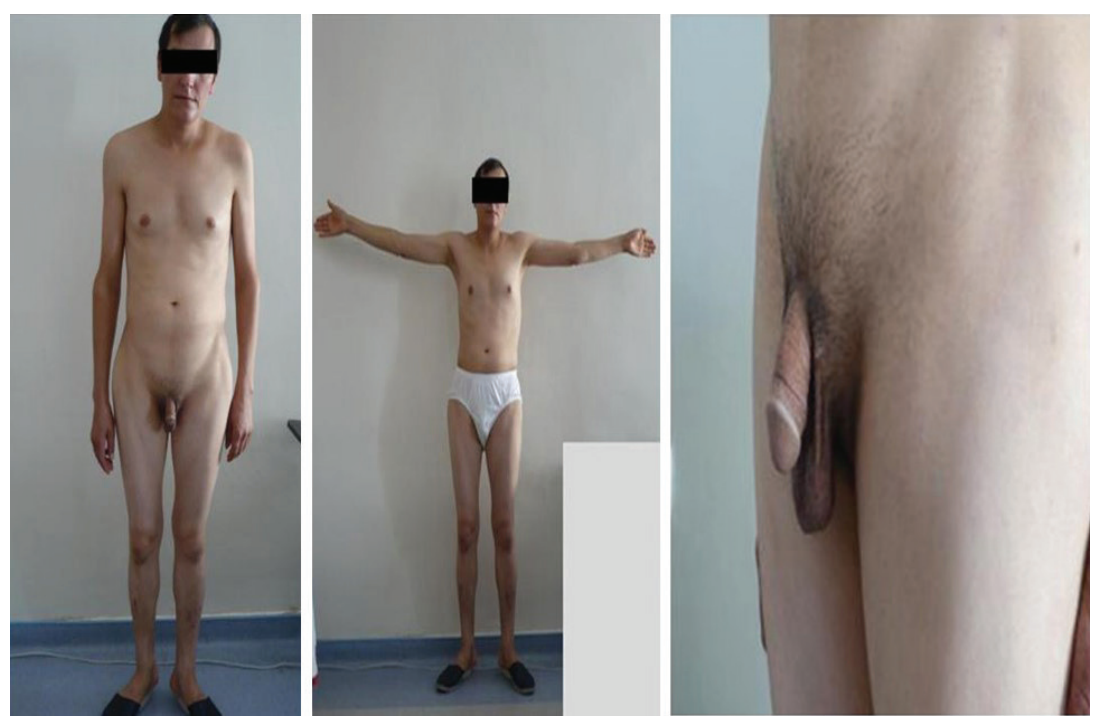
Figure 1. Patient with 47,XXY karyotype was 169 cm tall, weighed 59 kg, and was 39 years old. Body proportions were arm span of 176 cm, distance from crown of the head to the pubis of 80 cm, and from pubis to floor of 89 cm. Regression of secondary sex characteristics (absence of facial and chest hair, Tanner stage 3-4 axillary and pubic hair, 8 cm-long penis, below normal muscle mass, and feminine-type fat distribution) was also present.

Laboratory values as follows are provided in Table 1: Fasting blood sugar: 421 mg/dL (range: 74-106 mg/dL), glycated hemoglobin (HbA1c): 14.9% (range: 4.2-6.5%), follicle-stimulating hormone (FSH): 40 mIU/mL (range: 1.4-18.1 mIU/mL), luteinizing hormone (LH): 28.9 mIU/mL (range: 1.5-9.3 mIU/ mL), total testosterone: 71.4 ng/dL (range: 241-827 ng/dL), sex hormone binding globulin (SHBG): 35.7 nmol/L (range: 13-71 nmol/L), and estradiol (E2): <7 pg/mL (range: 11.6-41.2 pg/mL). These measurements were found to be consistent with hypergonadotropic hypogonadism. Furthermore, C-reactive protein (CRP) level: 1.96 mg/L, white blood cell count (WBC): 7.15 103/mL, and erythrocyte sedimentation rate (ESR): 7 mm/h were determined; there were no symptoms of infection. Karyotype analysis was consistent with 47,XXY KS. Scrotal ultrasound revealed presence of int-