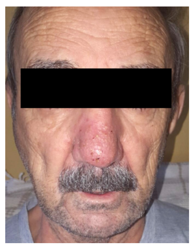
Figure 1. Papulopustular lesions on the face of the patient.

neous side effects, telangiectasia, hyperpigmentation, exacerbation of radiation dermatitis, oral aphthous ulcers, vasculitis, necrolytic migratory erythema, and temporary acantholytic dermatosis have also been reported. [3-5]