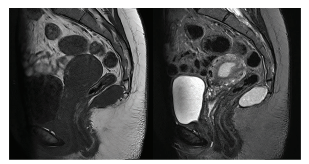
Figure 1. Axial plane image of the lesion in T1 and T2 weighted magnetic resonance imaging.