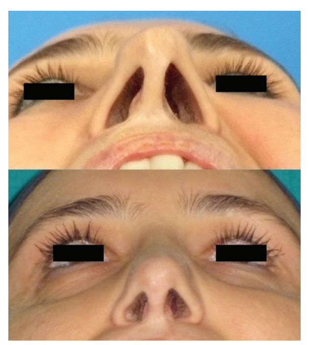
Figure 3. A patient with marked asymmetry of the nasal tip and extremely long collumela, secondary to bilateral cleft lip deformity (upper row) as seen in photo taken 24 hours after operation (bottom). Photograph taken 2 years after operation demonstrates achievement of distinct symmetry of the nasal tip and ideal length of the columella.

During mean postoperative follow-up period of 22.5