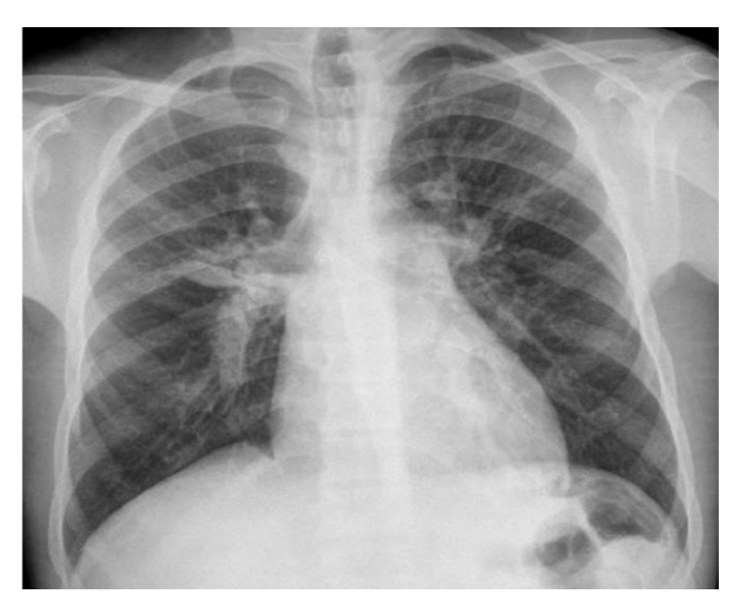
Figure 1: Initial Posteroanterior Chest X-ray (Bilateral pulmonary arteries were prominent, and pneumonic infiltration surrounded the vascular structures in the right upper lobe)

CTEPH is one of the leading causes of PHT (5). In patients with pulmonary artery pressure (PAP) exceeding 50 mmHg, average five-year survival is reported to be 10% (6). CTEPH should be considered in the differential diagnosis of patients presenting with chronic dyspnea and/or chest pain. CTEPH should be investigated with a CT thorax angiography and echocardiography in such cases. Surgery is the optimum treatment for patients diagnosed with CTEPH (7), although PEA has a high risk of morbidity and mortality (8-10). Accordingly, medical treatment (oral anticoagulant, CCB, ERA, Riociguat, etc.) is preferred in patients with PAP> 50mmHg and in the presence of an additional disease that may increase the risk of postoperative mortality and morbidity (11,12). OAC was initiated in our case due to sPAP: 105 (> 50) mmHg and CRF. However, the PEA operation was planned due to the patient's inability to respond to medical treatment and the patient's young age. While a renal transplant was contraindicated in the preoperative period due to PHT, a renal transplantation was possible due to the regression of the complaints, and the decrease in pulmonary artery pressure in the postoperative period.