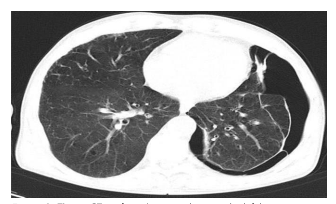
Figure 3: Thorax CT confirmed pneumothorax in the left lung