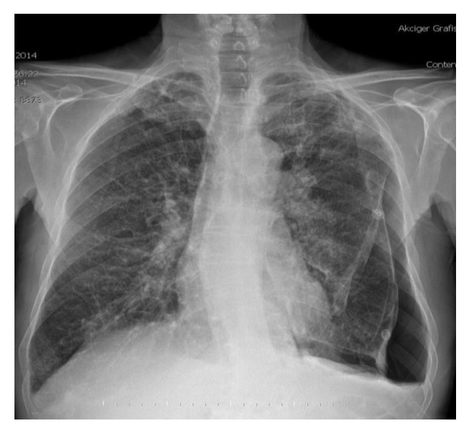
Figure 2: After spirometry left-sided pneumothorax was detected in PA chest x-ray