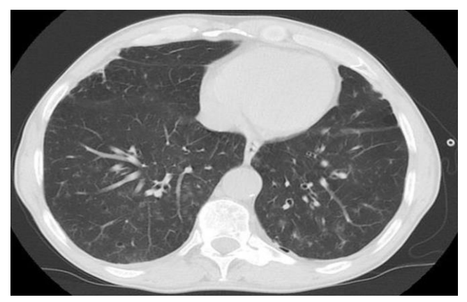
Figure 5: Control Thorax CT showed re-expansion of the left lung after tube thoracostomy

The clinical diagnosis of pneumothorax is based on the anamnesis, physical examination, and radiological investigations (13,15,16). The clinical results are dependent on the degree of collapse on the affected lung (17). Although 10% of pneumothoraces are asymptomatic, the symptoms due to the symptomatic pneumothorax consist of acute chest pain, breathlessness, tachypnea, and tachycardia (18). Additionally, a shift of the mediastinum and haemodynamic instability may occur if the pneumothorax is significant (17).