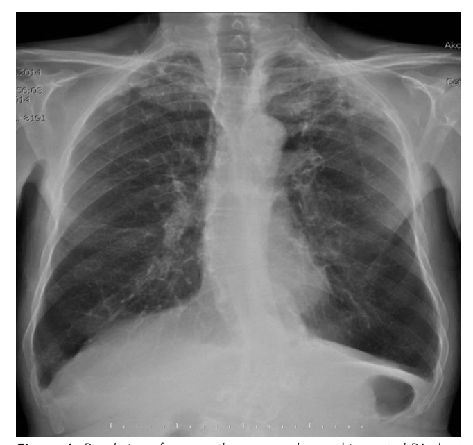
Figure 4: Resolution of pneumothorax was observed in control PA chest x-ray