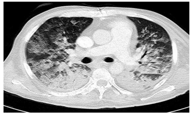
Figure 2: A thoracic computed tomography scan showing diffuse consolidation areas in both lungs

with TACO and cardiogenic pulmonary edema usually require diuretic treatment and fluid restriction, whereas such strategies should be avoided in patients with TRALI. In our case, there were no physical signs of volume overload or heart failure. Central venous pressure was normal and transthoracic echocardiography showed that the prosthetic valve was functioning properly, ejection fraction was measured as 55%, and there were no sign of cardiac dysfunction.