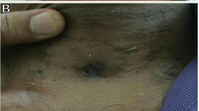
Figure 1A and B: Examination of the neck; A (top) Tracheostomy site, inflammation and purulent discharge; B (bottom) Tracheostomy, healed and closed, after 2 months of anti-tuberculosis therapy