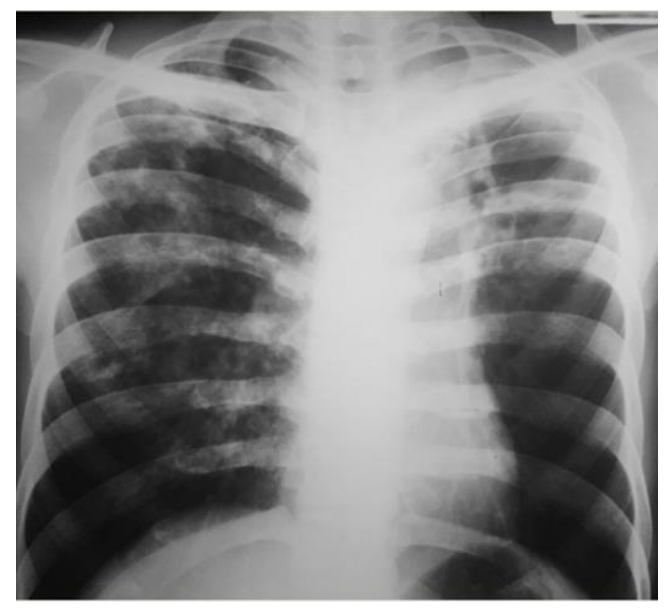
Figure 2: Chest X-ray: Right upper zone, Left upper zone opacities

He had also received a 2-week course of antibiotics for methicillin-sensitive Staphylococcus aureus grown in pus