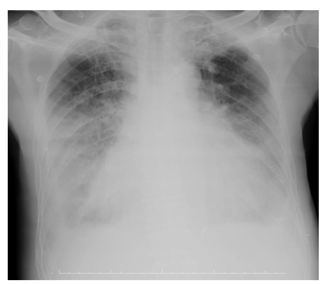
Figure 3: The radiograph of the chest revealed an increase in the cardiothoracic ratio and water bottle sign