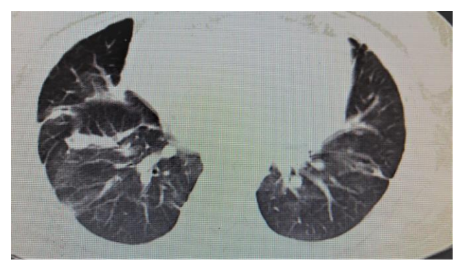
Figure 2a: CT scan of the thorax showed a ground-glass opacity appearance with traction bronchiectasis in bilateral lung fields