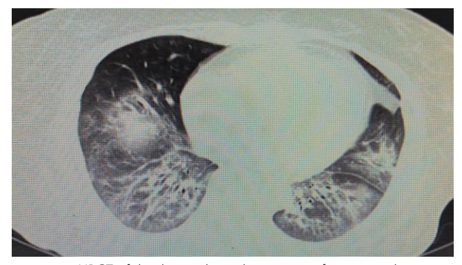
Figure 1: HRCT of the thorax showed a non-specific interstitial pneumonia pattern

A physical examination revealed a moderate general appearance, a respiratory rate of 20 breaths per minute and an oxygen saturation of 96% in room air. She looked pale and had anemic conjunctiva. Late inspiratory crackles were heard upon pulmonary auscultation, and edemas were noted in the lower extremities. An HRCT scan of the thorax revealed ground-glass opacity with traction bronchiectasis in the bilateral lung fields (Figure 2a). AFB smears of the sputum were checked and the results were negative. A blood hemogram revealed hemoglobin of 8.2 gr/dl. An autoimmune serology test showed positive of ANA, ds-DNA, nucleosomes, histones, Ro-52 and SSA antibodies. The patient was diagnosed with ILD-related SLE. A spirometry test resulted in 22.5% forced vital capacity (FVC) and 23.6% forced expiratory volume in 1 second. The patient was treated with CS and Cellcept® 1000 mg bid. One month after treatment the patient showed clinical improvement, and six months later, an HRCT of the thorax was carried out for re-evaluation, and further improvement was noted (Figure 2b).