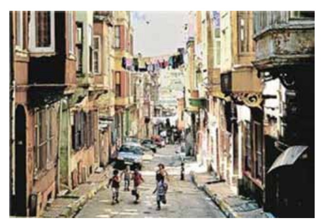
Figure 3. Picture of Tarlabasi.

The Tarlabasi renewal area consists of nine blocks and 278 lots. In this project, 70% of which is made up of listed structures, all buildings are to be demolished regardless of their his-