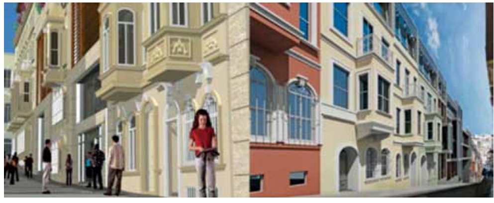
Figure 2. Models for Tarlabasi Renewal Project taken from Gap Insaat.

Besides this, they were also unhappy with turning most of the places into hotels, cafes, art galleries or designer shops. They said that, it was only to make more profit in the area but with the increase in these commercial areas, Galata was losing its original features, because people who use the buildings for commercial reasons do not take care of them as they should.