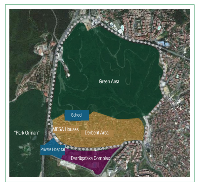
Figure 2. Derbent Neighbourhood.