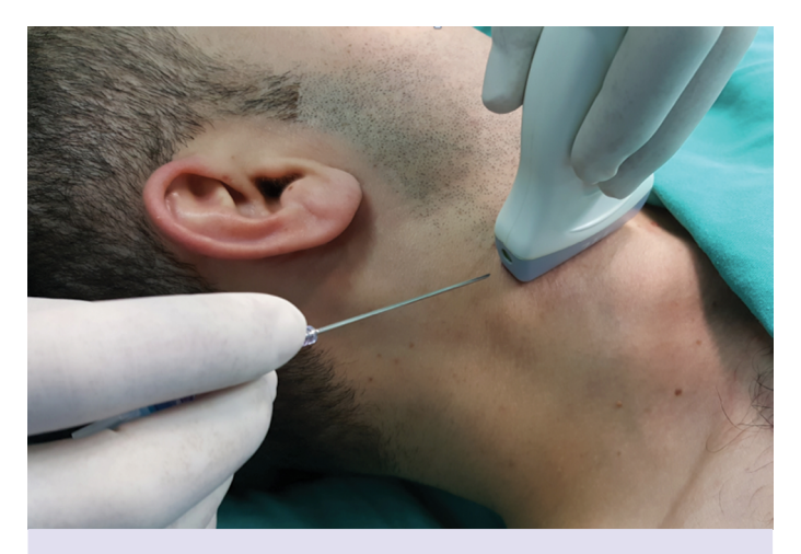
FIGURE 1. The position of the ultrasound probe and the needle during catheterization using the oblique approach.