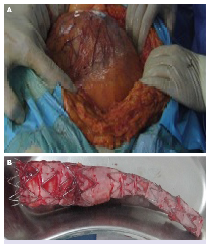
FIGURE 2. A huge aneurysm sac is seen after laparotomy (A); endovascular graft after resection (B).

Multiple techniques for the treatment of type Ia endoleak have been described in the literature with variable success rates. Usually, endoleaks can be treated with endovascular procedures. Standard endovascular treatment options for type Ia endoleaks include insertion of an aortic cuff to extend the endograft coverage more proximally or repeated ballooning or placement of a large-caliber, balloon-expandable stent inside the proximal endograft [6, 7]. Despite these interventions, if the endoleak still persists, conventional open surgery should be considered. Early detection and classification of the endoleaks are crucial for proper management and treatment. In the present case, the patient underwent open