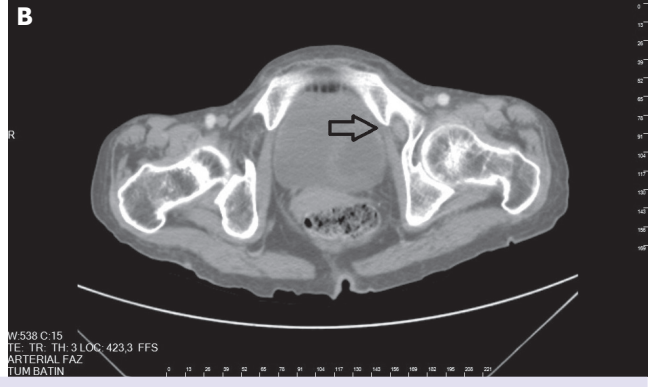
FIGURE 2. Intestinal loop in the left inquinal obturator channel.