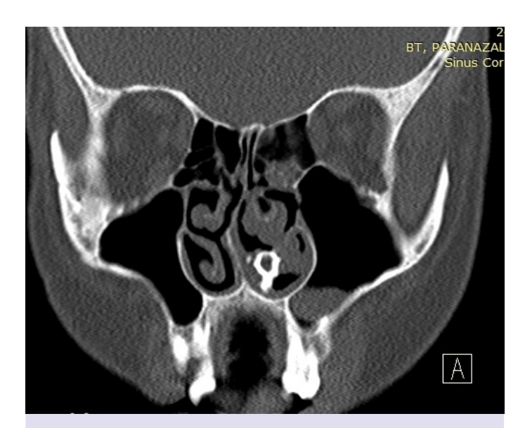
FIGURE 2. Computed tomography appearance of a rhinolith between inferior turbinate and septum on the left side.

Other rare locations of rhinolith were between middle turbinate and septum (9.7%) and lateral to middle turbinate (6.5%) (Table 1).