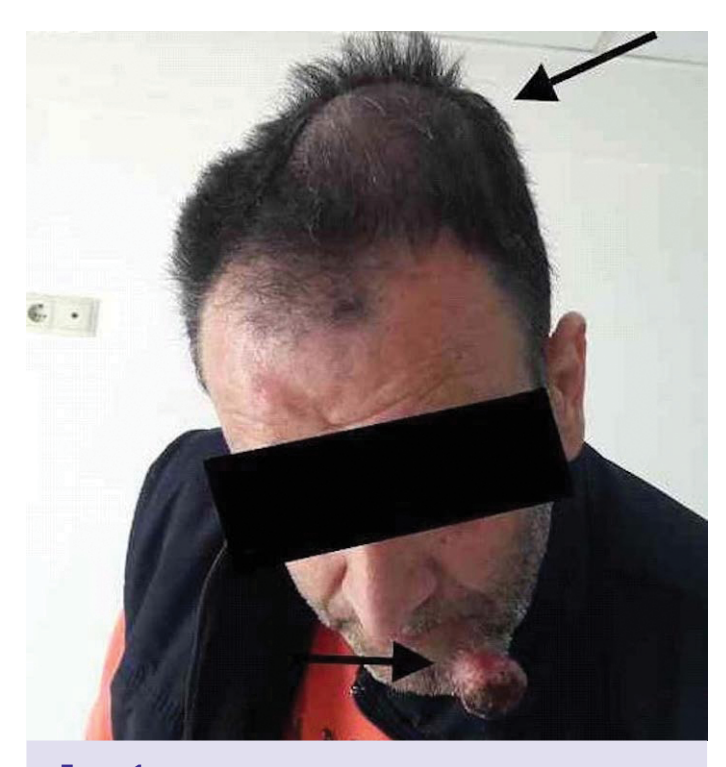
FIGURE 1. Subcutaneous lump was seen on his scalp and mandibular.

an, and bevacizumab were started. After 6 cycles of regimen, new lymph nodes appeared in his abdomen and his intra-abdominal mass become greater. His treatment changed to regorafenib 120 mg/day. Five months later on his physical examination, a subcutaneous lump was seen on his scalp and mandibular (Fig. 1). Computerized tomography of the brain revealed a 13×7.5 cm mass in the left parietal region that disrupted the calvarial bone (Fig. 2). A biopsy of the scalp lesion with a diameter of 0.5 cm was obtained. Histological examination of biopsied tissues showed metastasis of rectal adenocarcinoma (Fig. 3). His performance become worsening, he hospitalized and palliative support treatment was started. He died 3 months after the diagnosis of cutaneous metastasis.