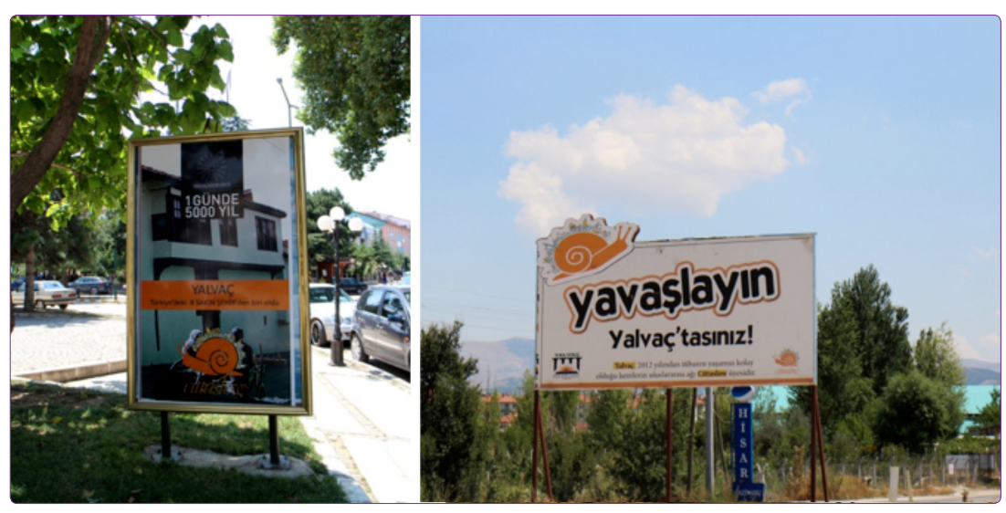
Figure 1. Slogan and Cittaslow Logo of Yalvaç.