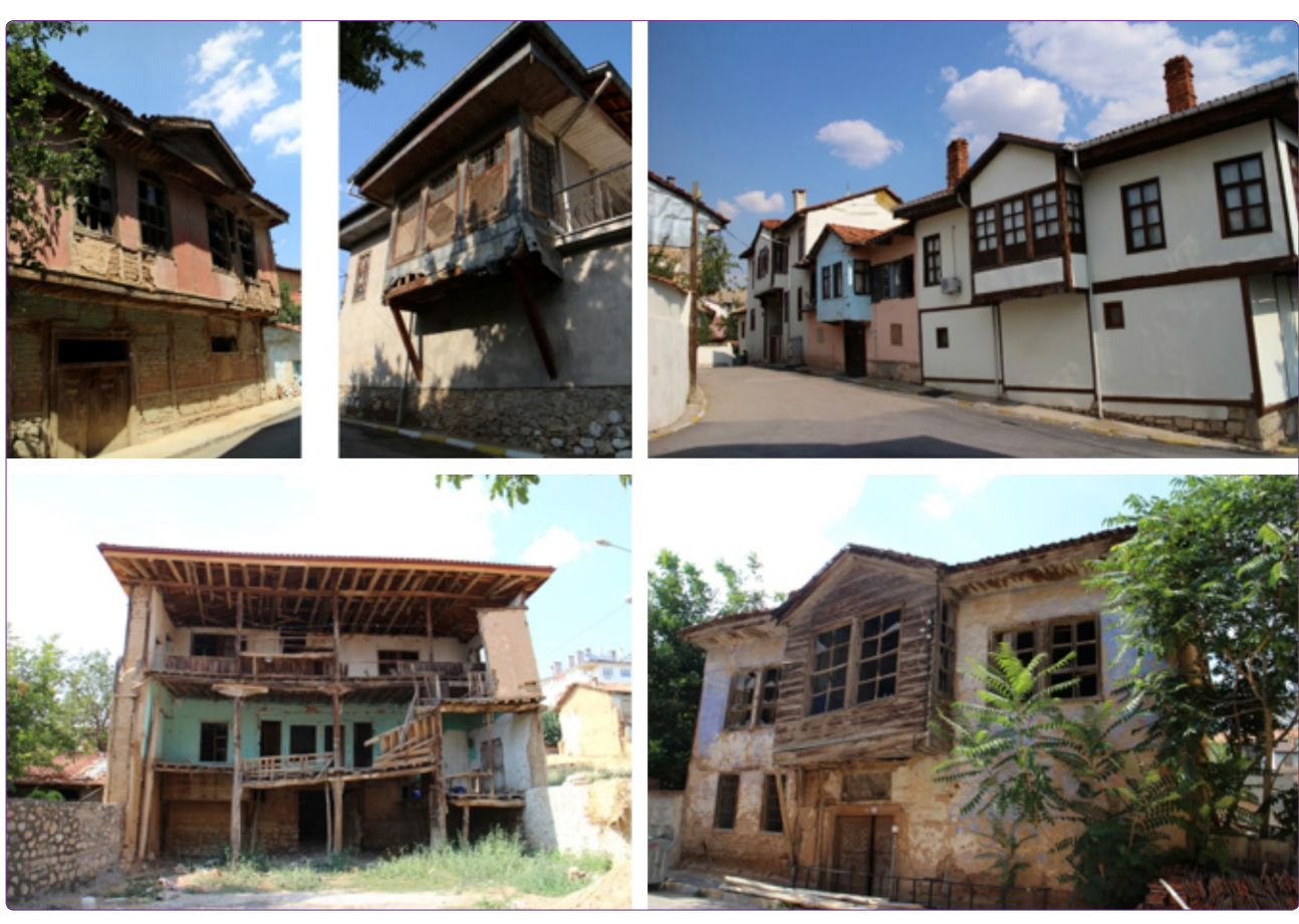
Figure 4. Some Examples From Yalvaç's Vernacular Architecture.