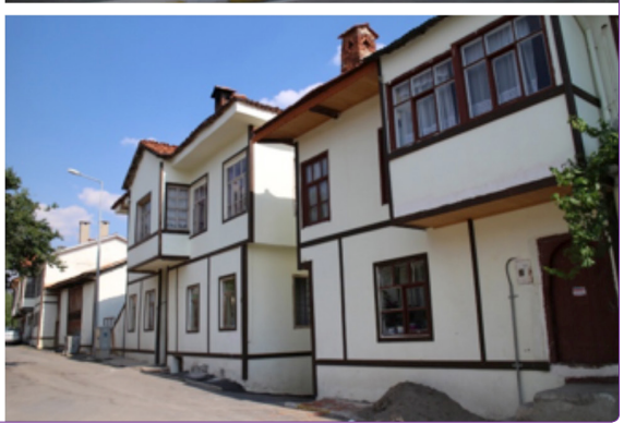
Figure 7. Examples from Rehabilitation of Vernacular Architecture.

The purpose of this project, carried out in two stages in 2002 and 2009 consecutively, is to identify natural, cultural and archeological assets, traditional lifestyles and cultures and to provide tourism oriented economic and social development through developing and maintaining them as a whole.<sup>37</sup> Within this framework, some of the following project outputs are realized and some of them are foreseen to be realized in progress of time:<sup>38</sup>