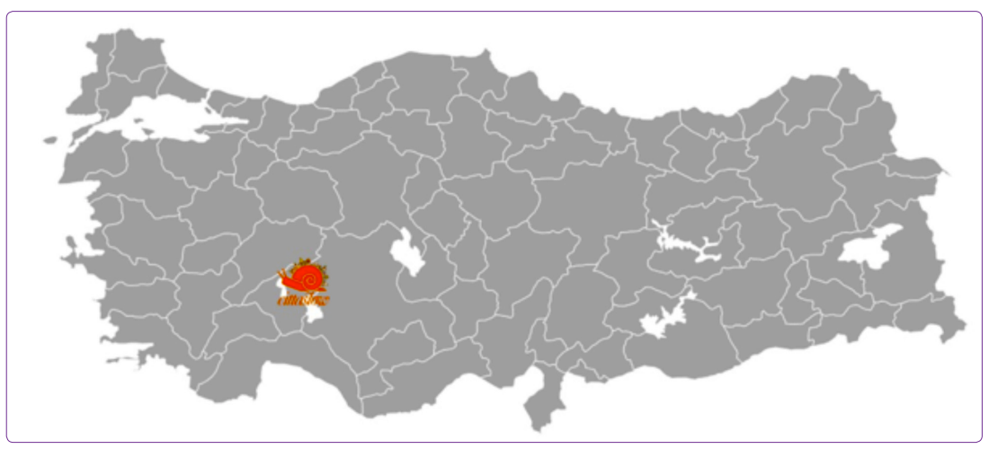
Figure 2. Location of Yalvaç on Map of Turkey.

made up of 71 requirements, grouped under seven main topics such as energy and environmental policies, infrastructure policies, quality of urban life policies, agricultural, touristic and artisan policies, policies for hospitality, awareness and training, social cohesion and partnerships. It is necessary for towns to carry out at least 50% of these requirements for enrolling the association.<sup>12</sup>