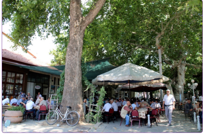
Figure 8. Çınaraltı Square.

Rearrangements of Squares: The floor coverings of Çınaraltı Square -where 800 years old plane tree is standing-, facades of coffeehouses and shops facing the square and its urban furniture were renovated (Figure 8). Moreover, It was decided that the area in front of the municipality would be designed as a square which would introduce the town and give information to the visitors. This square, called "Narrating Square", was selected by a board of academicians, Chamber of Architects of Antalya and the Foundation for the Protection and Promotion of the Environment and Cultural Heritage among projects participated in a National Design Competition. Today, this square has been newly built according to the selected project (Figure 9). It is the starting point of Yalvaç cultural route which has been formed in time. Besides, smaller squares in tradition-