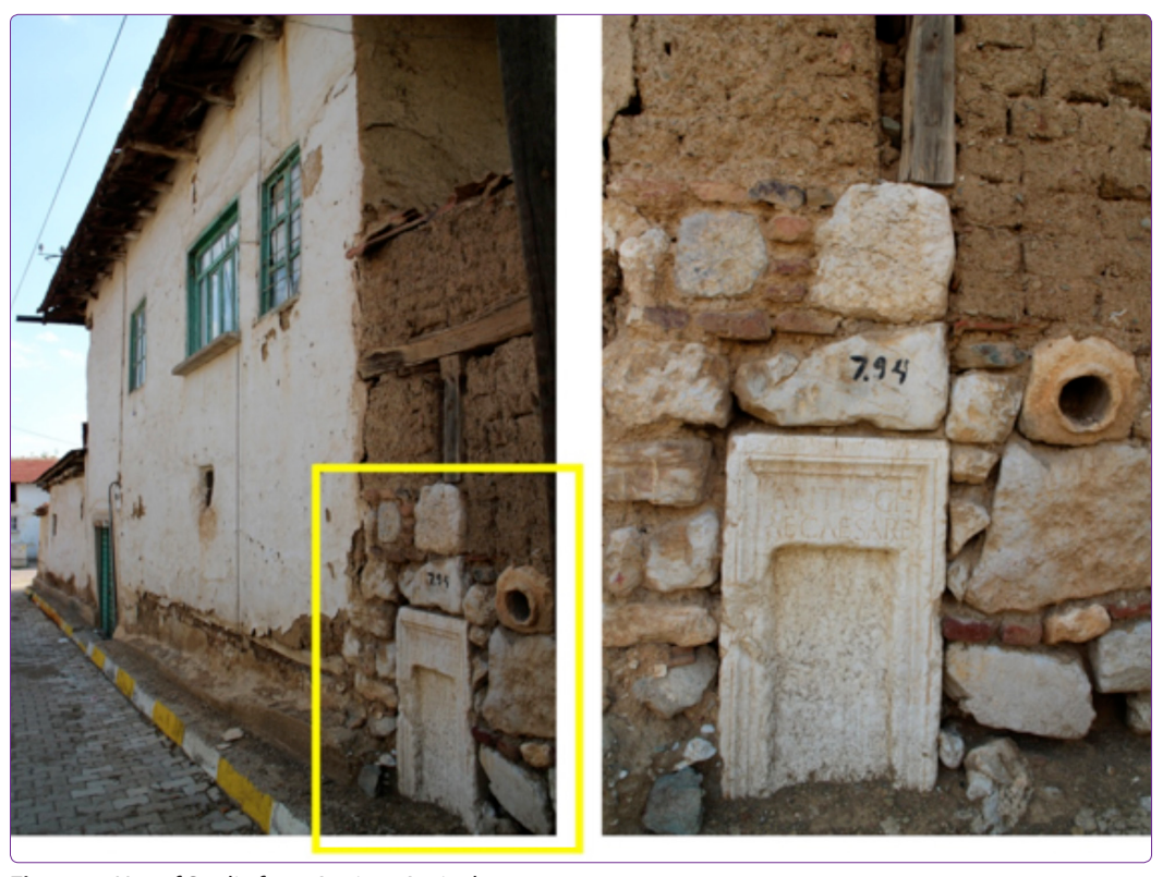
Figure 5. Use of Spolia from Ancient Antioch.