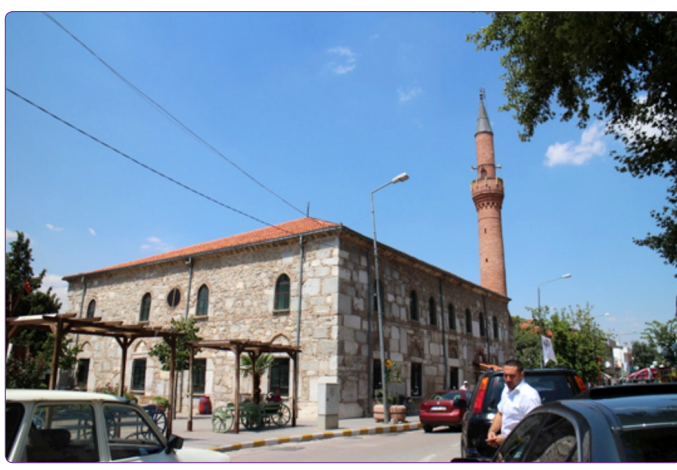
Figure 3. Devlethan Mosque from Beyliks Period.

Today, Ancient Antioch of Pisidia is a significant archeological site with the remains of St. Paul's Church, Augustus Temple, Tiberius Square, Theater, Aqueducts, Roman Bath