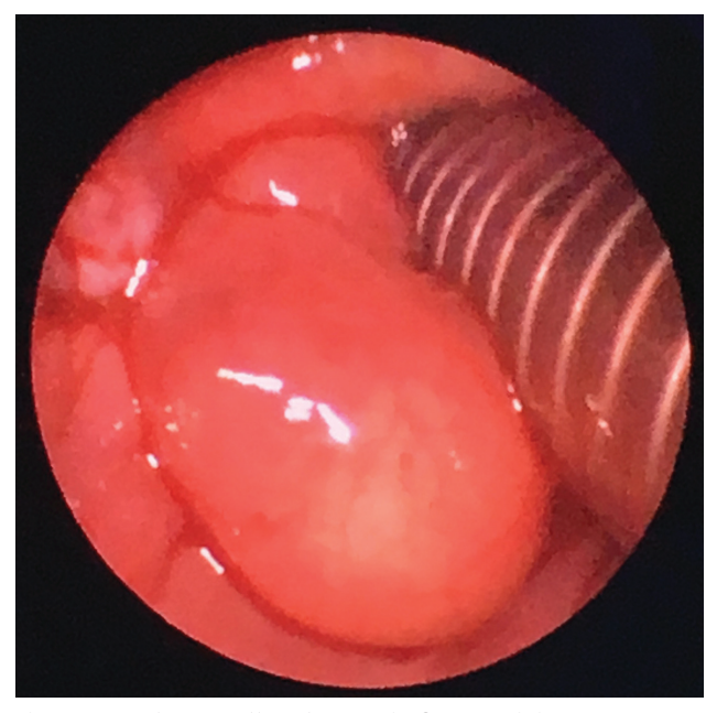
Figure 4. A large vallecula cyst before excision.

operatively, three laryngeal cysts were found, one at the left vallecula measuring 4 cm \times 3 cm, one at the right vellecula measuring 0.5 cm \times 0.5 cm