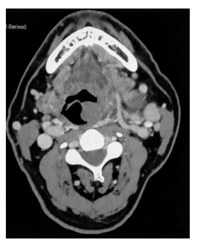
Figure 3. Axial CT neck showing the laryngeal cyst.

Cyst was operated under general anesthesia in the same session with total thyroidectomy. Intra-