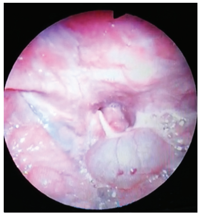
Figure 1. A FNPLS revealed a large globular mass with smooth surface at the vallecula region.

A 68-year-old man presented with progressively increasing left neck swelling for one-year. There was no history of dysphagia, hoarseness, noisy