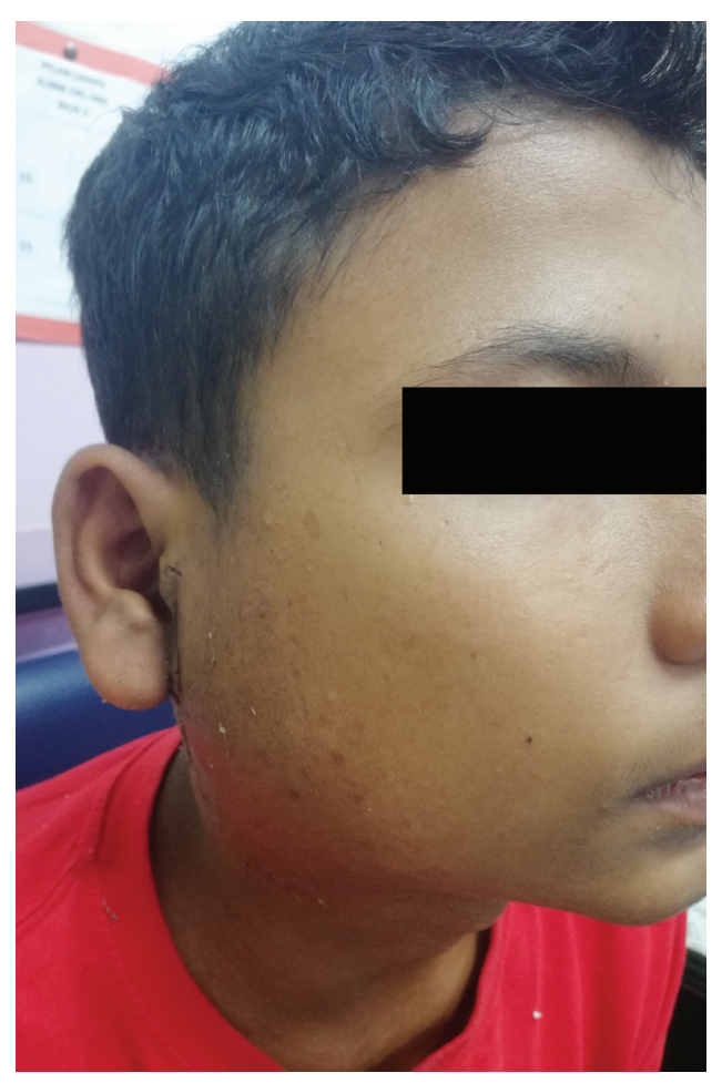
Figure 5. One week after operation, minimal edema edematous at right parotid region.

gland could be removed with preservation of the facial nerve. The patient was discharged on day three after the operation and the maintenance dose of prednisolone was continued. The wound was cleaned leaving a minimally edematous area at the right parotid region observed after one week (Figure 5). Histopathological examination (HPE) of the parotid gland was consistent with KD. The facial nerve was intact postoperatively.