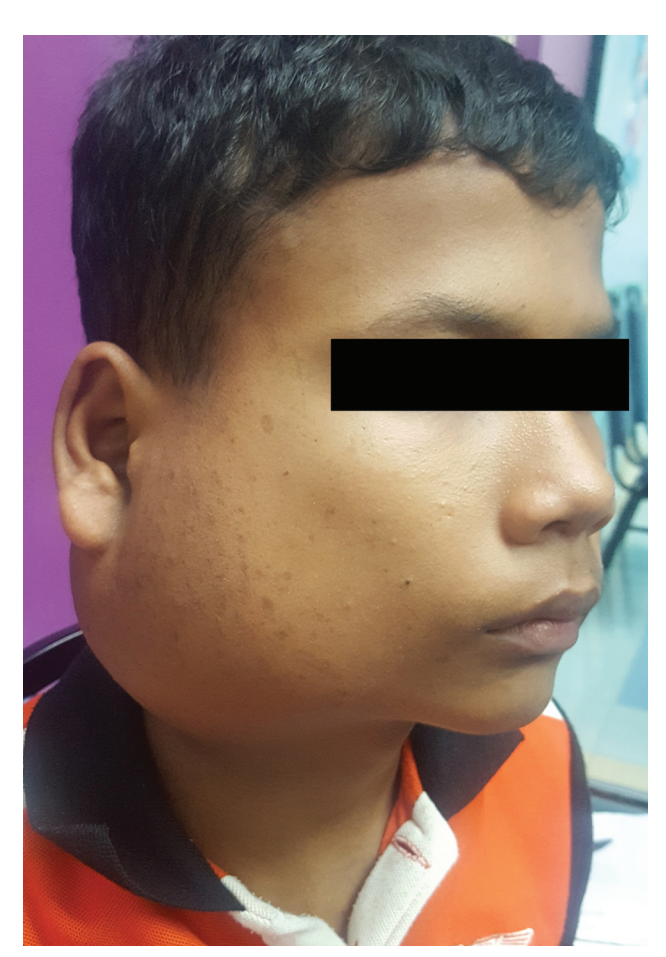
Figure 1. A huge swelling at right parotid region lesion measuring 13 cm \times 13 cm with hyperpigmented skin.

was causing facial disfigurement. Examination showed the presence of right parotid swelling, measuring 13 cm x 13 cm, extending from the zygomatic region superiorly to the submandibular region inferiorly and from the cheek region anteriorly to the post-auricular region posteriorly (Figure 1). The swelling was firm, non-tender with hyperpigmentation of the overlying skin. Multiple LNs were palpable at the right levels II and V. Other examinations were unremarkable.