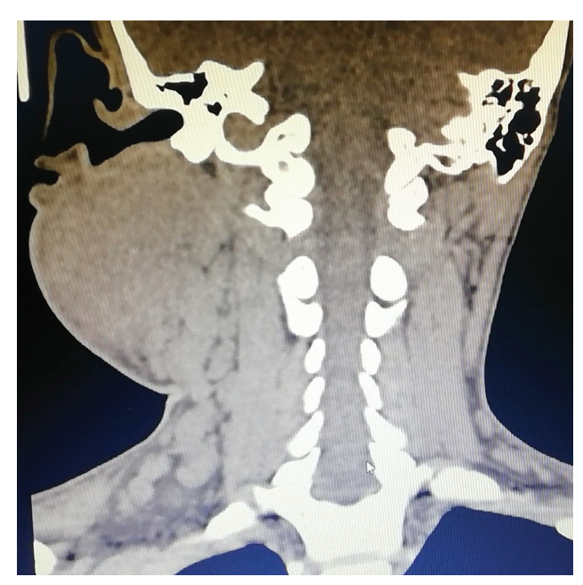
Figure 2. CT neck showed ill-defined large heterogenous enhancing soft tissue mass at right parotid mass measuring 7.6 cm \times 5.0 cm \times 8.7 cm, with multiple enlarged right cervical LN.

cm \times 8.7 cm, involving the right parotid gland and also the presence of multiple enlarged right cervical LNs from levels I to V (Figure 2).